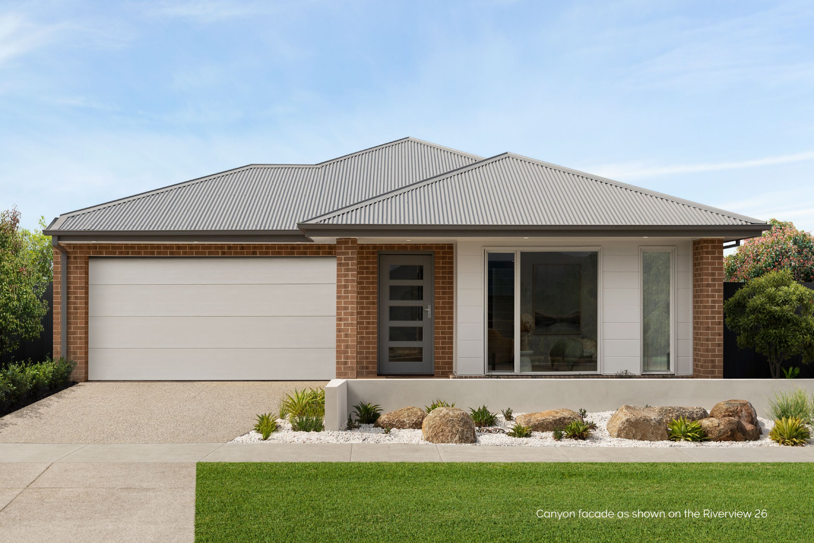
Canyon facade as shown on the Riverview 26