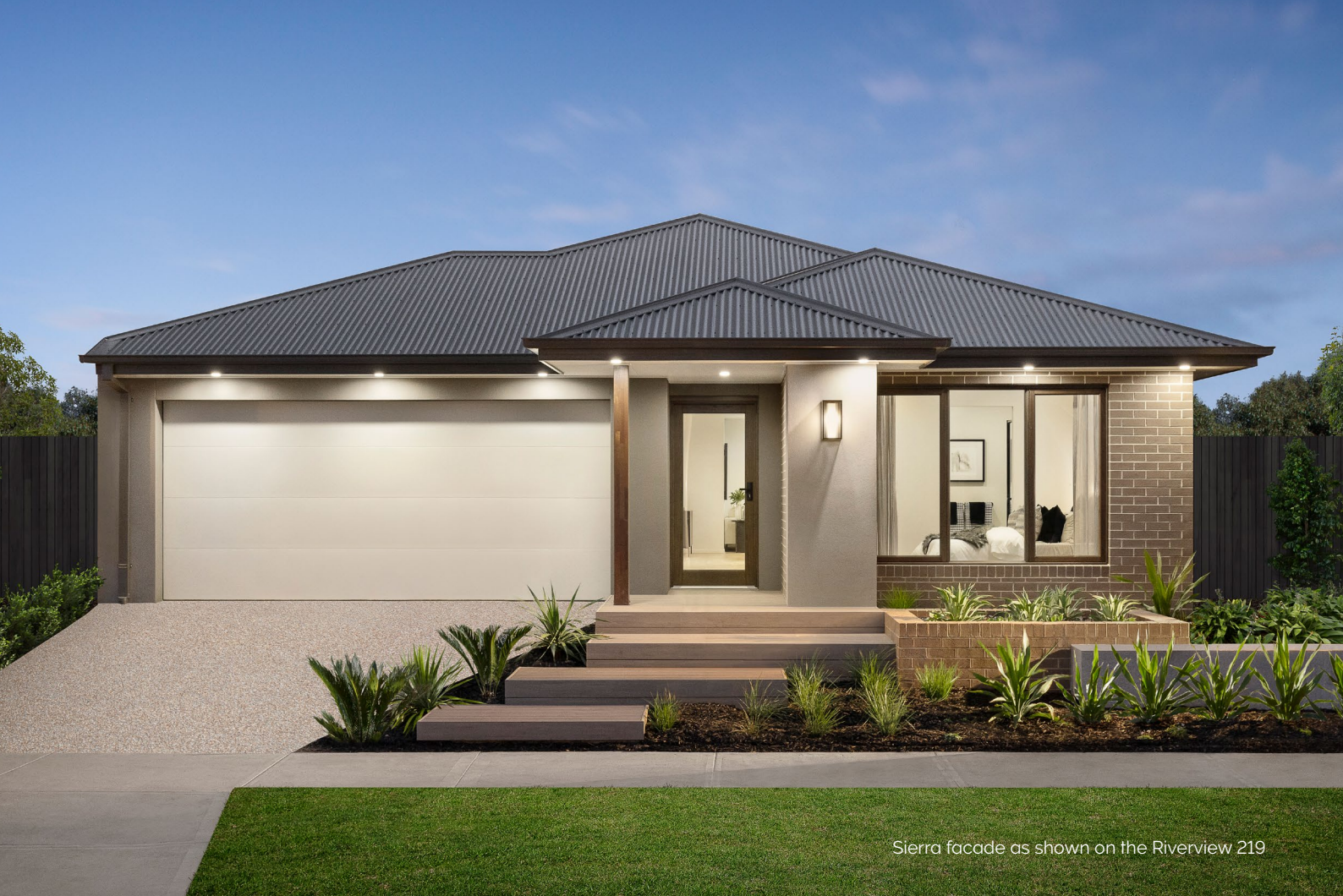
Sierra facade as shown on the Riverview 219